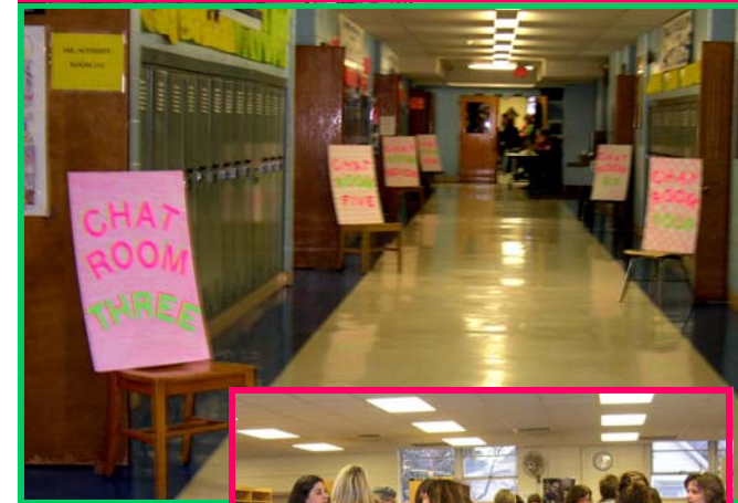
Chick Chat '09 served 175 fourth– through sixth-grade girls while the accompanying Mom Chat offered their mothers inspiration and advice.